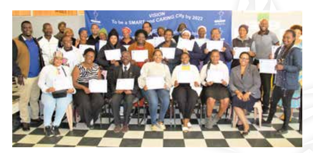
Growing: In August this year, over 50 community members successfully completed urban agriculture training courses and received certificates with which they can apply for grants from the Ministry of Agriculture, Water and Land Reform (MAWLR) to grow their enterprises.